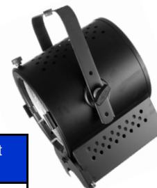
Altman 75Q 8"