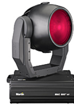
Martin MAC 600