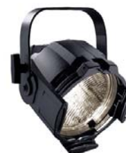
Source 4 Par