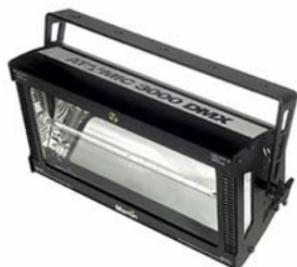
Martin Atomic 3000 Strobe 120V