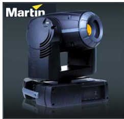
Martin MAC 250 Entour