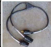
Edison 2 -Fer