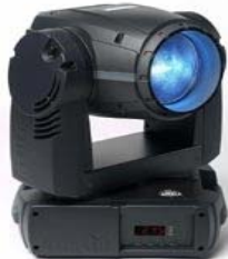
Martin Mac250 wash