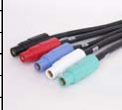
Female Cam locks