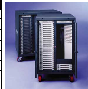
Dimmer ETC Sensor 48