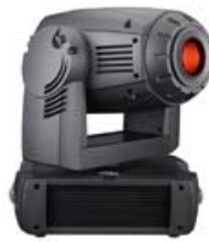
Martin MAC 700