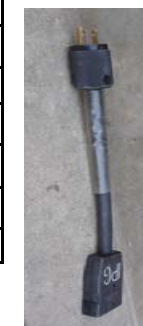
Adapter female Stage pin to male Edison