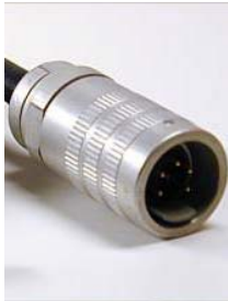
5 Pin Data Cable