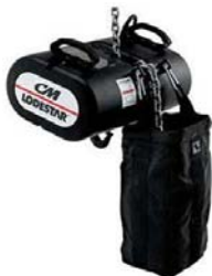
1/2 ton motor