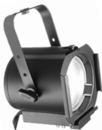
Altman 65Q 6"