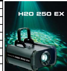
H202 Water/Fire Effects