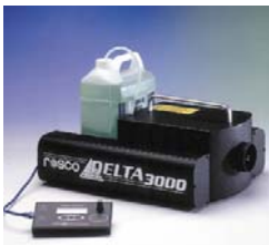
Delta 3000 Fog Machine