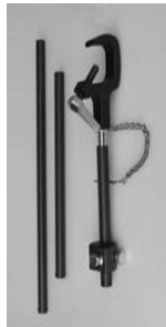
Mega Baby Sidearm