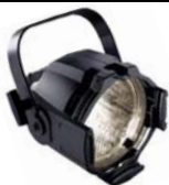
Source 4 Par